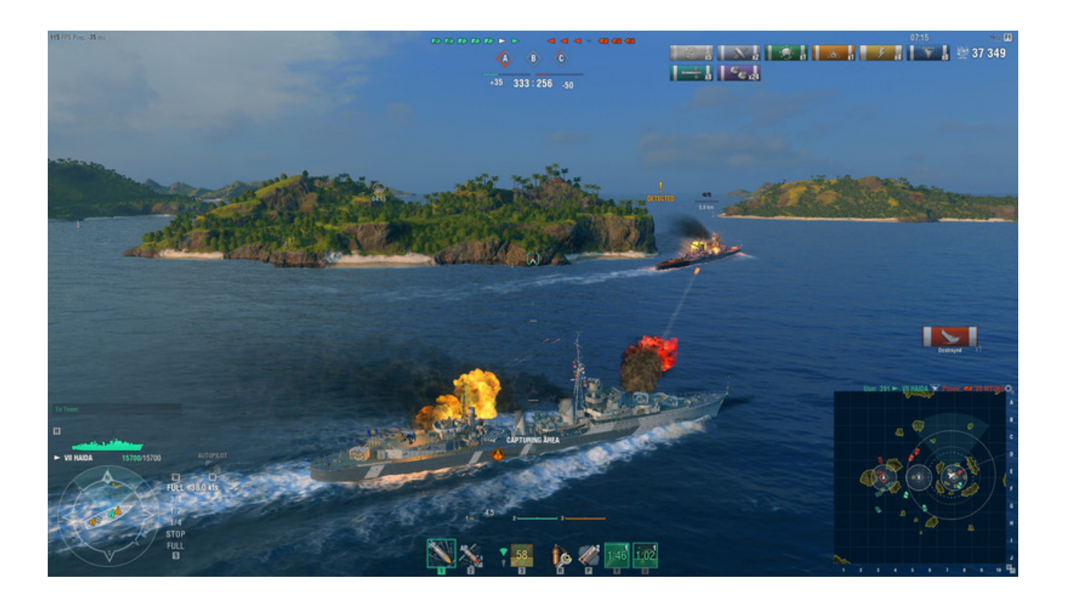
World Of Warships - Haida Pack Torrent Download [key]